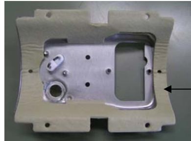
Plate Gasket (1)

Electrode (1) Electrode Packing (1) Electrode Retainer (1) Electrode Sleeve (1)